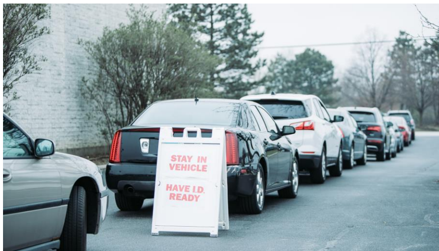
Residents lined up early for Orland Township's drive-thru grocery distribution on April 24. The next distribution will be held at Orland Township on Friday, May 8.